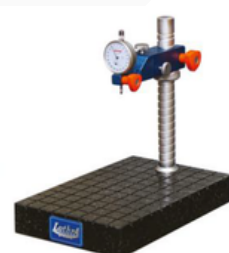
LGS - 18