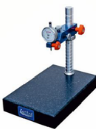
LGS - 15