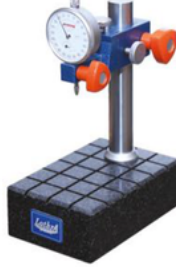
LGS - 4