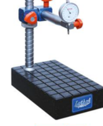
LGS - 13