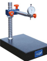
LGS - 16