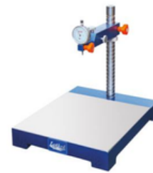
LCS - 29