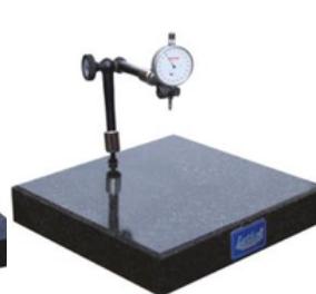
LGS - 27