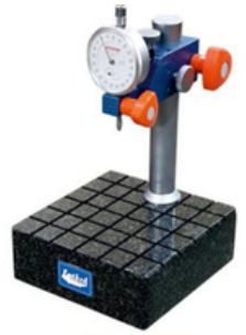
LGS - 7