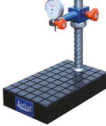
LGS - 11