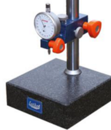
LGS - 6