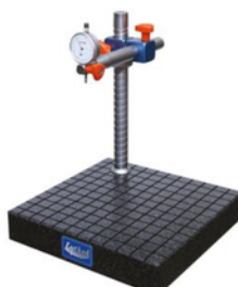
LGS - 25