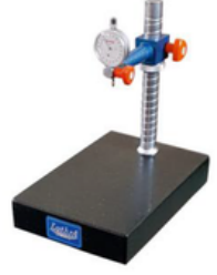
LGS - 14