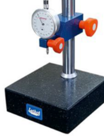
LGS - 5