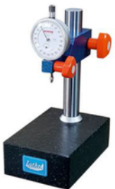
LGS - 1