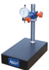
LGS - 8