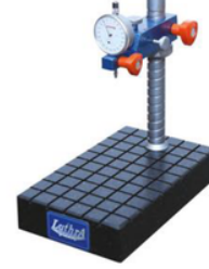
LGS - 12