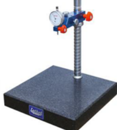
LGS - 21