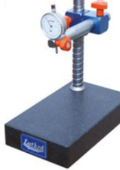
LGS - 10