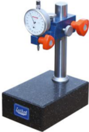
LGS - 2