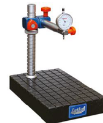
LGS - 19