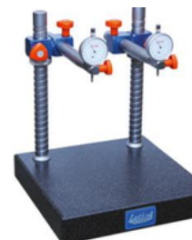
LGS - 26