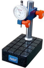
LGS - 3