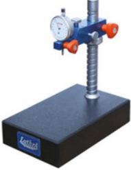
LGS - 9