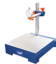
LCS - 32