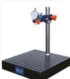
LGS - 24