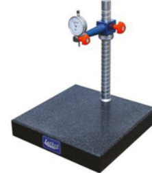
LGS - 20