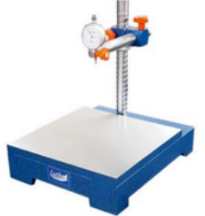
LCS - 33