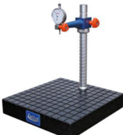
LGS - 23