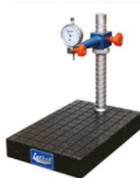
LGS - 17