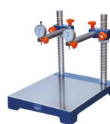
LCS - 31