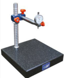
LGS - 22