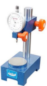
LCS - 1