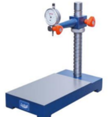
LCS - 12