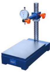
LCS - 15