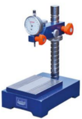
LCS - 7