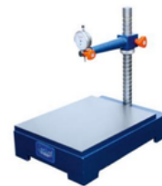
LCS - 26