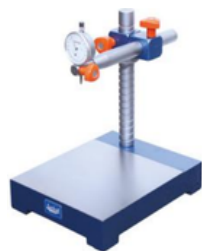
LCS - 20