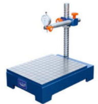
LCS - 27