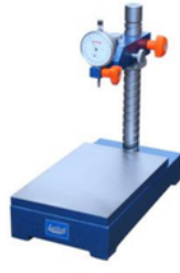
LCS - 16