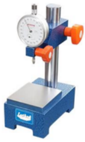
LCS - 3