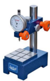
LCS - 4