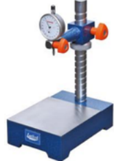
LCS - 9