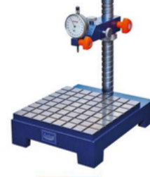
LCS - 23