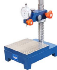
LCS - 11