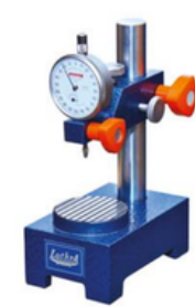
LCS - 2