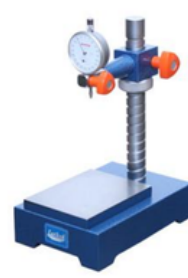
LCS - 5