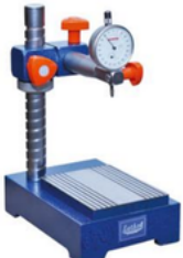
LCS - 8