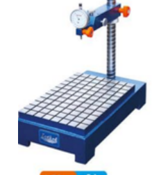
LCS - 24