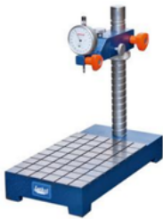
LCS - 14