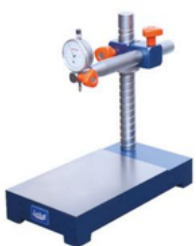
LCS - 13