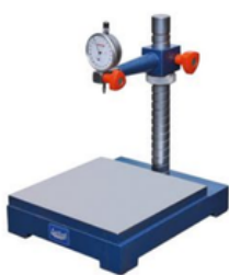
LCS - 21