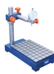
LCS - 17