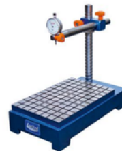
LCS - 25