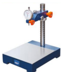
LCS - 19