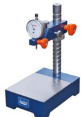
LCS - 10