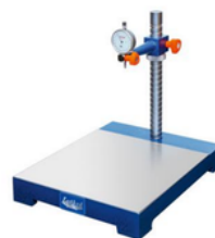
LCS - 28