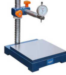
LCS - 22