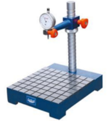
LCS - 18