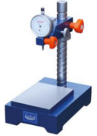
LCS - 6